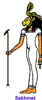
Sekhmet with Uas